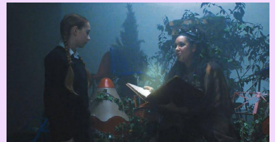
Plant This Seed