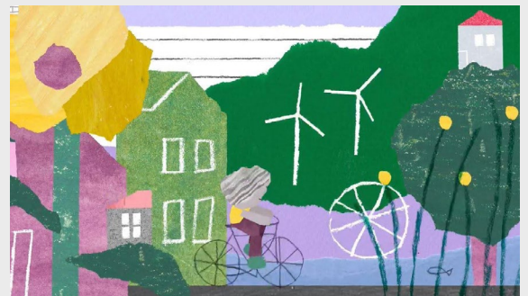
Plant This Seed