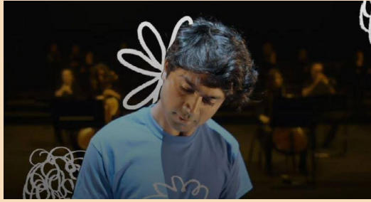
Blue, Red, Yellow...