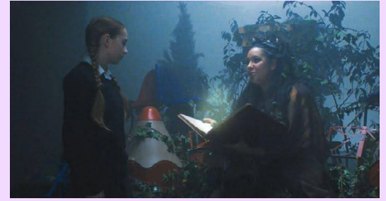
Plant This Seed