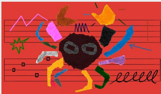
Blue, Red, Yellow...